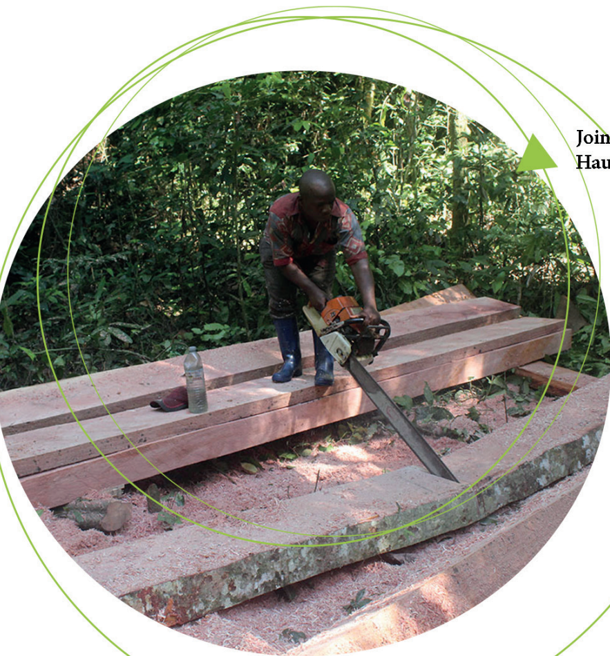
Joint independent observer mission in the DRC's Haut-Uélé province p2