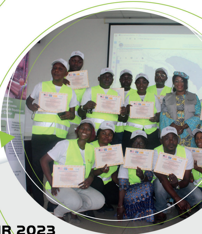
Capacity Building Workshop for Inspectors of the Control and Verification Unit of the Ministry of the Environment in Kinshasa on the use of tools for collecting forest information p9