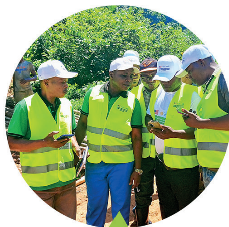
Capacity building workshop for forest law enforcement services in Isiro on the use of forest information collection tools p4